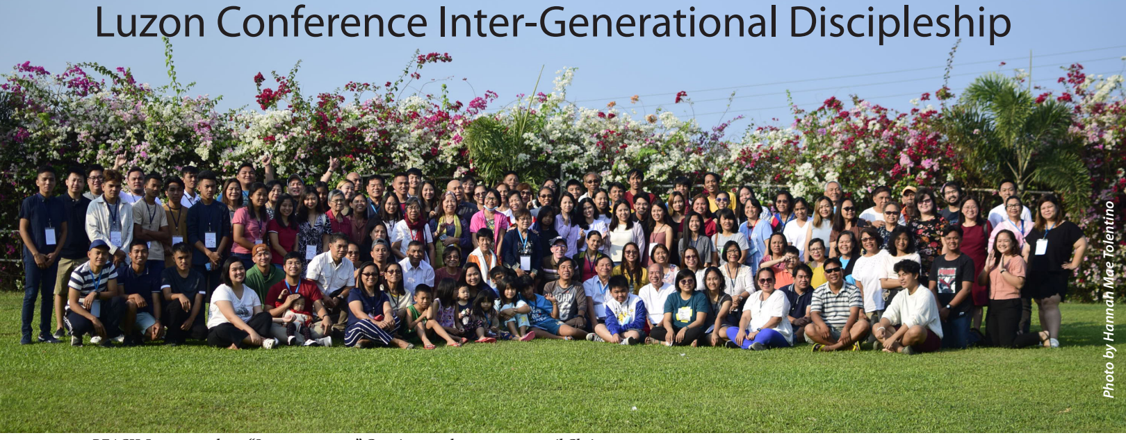
REACH-Luzon members: "Sama sama tayo." Growing together as a team until Christ returns.

Around 180 people gathered in Ilocos Norte for the first face-to-face national activity since the pandemic began, despite initially expecting 60 to 80 attendees. Intergenerational discipleship served as the conference theme.