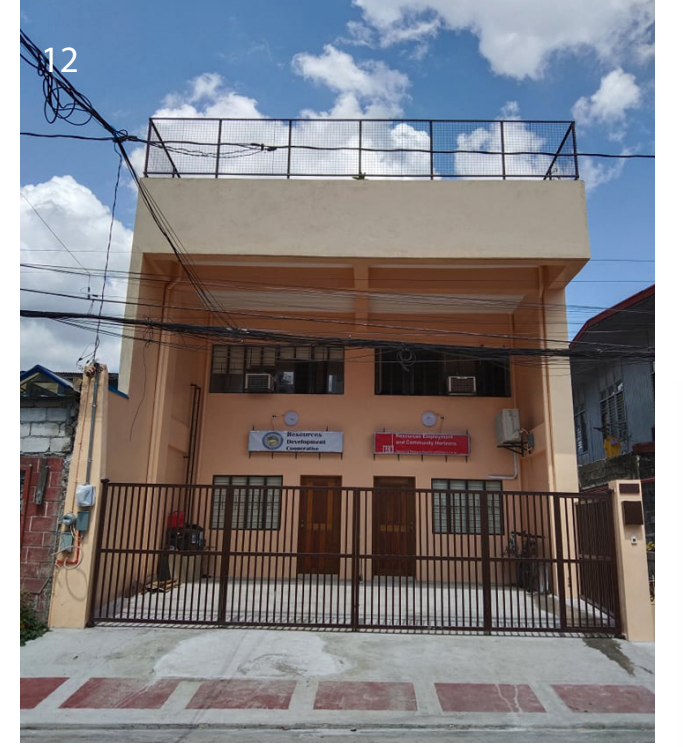
Phase two of the building program includes additional floors for a conference hall and sleeping quarters for activities.

EACH is still waiting for approval of a building permit from the Quezon City government before beginning phase two of the national office building. In the meantime, the building fund stands at P3,496,893.53 as of July 2023 out of a projected budget of P7 million. Please pray for additional funds to come in and for approval of the building permit.