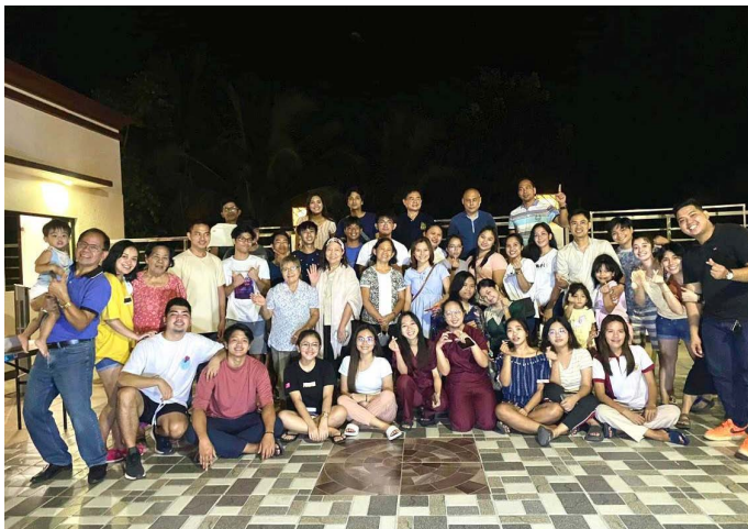
CLSU ministry welcomes freshmen students.