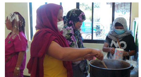
Barangay Health Workers helped the REACH worker identify and invite needy children and prepared food and distributed multi-vitamins.