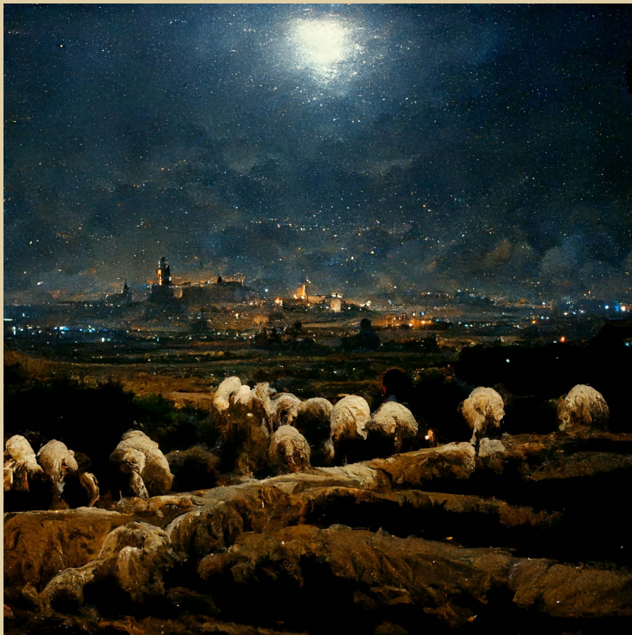
Sheep in the Judean hills outside Bethlehem. Illustration generated by artificial intelligence (MidJourney).

The Holy Family fled to Egypt prompted by an angel's warning. But