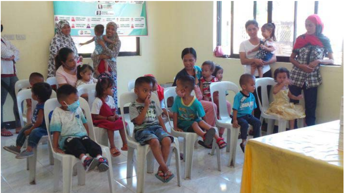
Twenty-five children participated in the feeding program in a General Santos City barangay where REACH hopes to establish a community development project.