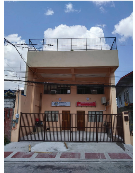
REACH national headquarters at 7 Bignay St. Proj. 2, Quezon City.

We originally planned to start the next construction phase after 2-3 years, but God had a different timeline than ours. We are reminded that in 2019 when the contract to build phase one of the national headquarters was signed, REACH had a little under PHP 1,000,000, lacking more than two-thirds of the needed funds. But praise the