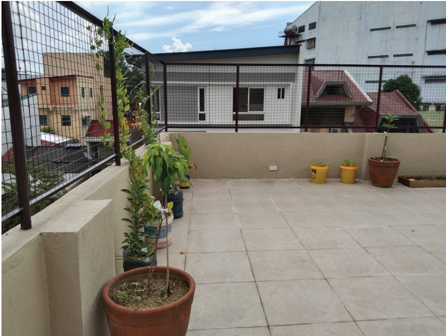
The current roof deck will become the second floor of the REACH national headquarters.

Our faith journey towards building a home for REACH after more than four decades of renting saw the construction of a one-story with mezzanine structure. This was phase one of the proposed multistory REACH national headquarters and accomplished by God's grace at the height of the global pandemic in 2020.