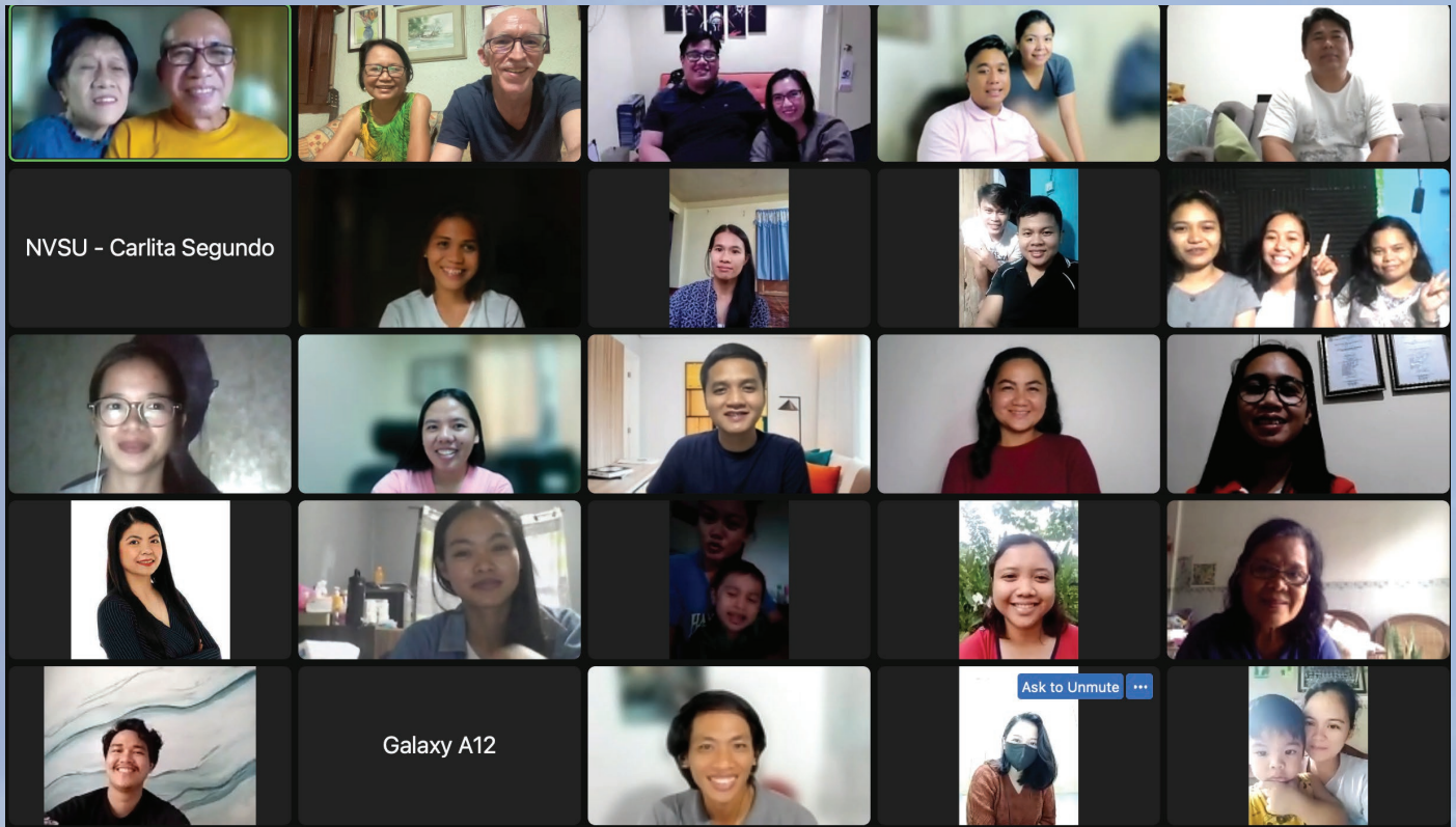
YLTP alumni from 2012, 2013, 2015, and 2018 attended an online reunion sharing their journeys along life's road.

Alumni of four Youth Leadership Training Programs (YLTP) that stretched over ten years gathered on-line for a reunion on April 7. Nearly 30 people attended. The reunion provided a chance to update on one another, learn from each other's experiences, and be challenged and encouraged to continue walking with God and serving Him.