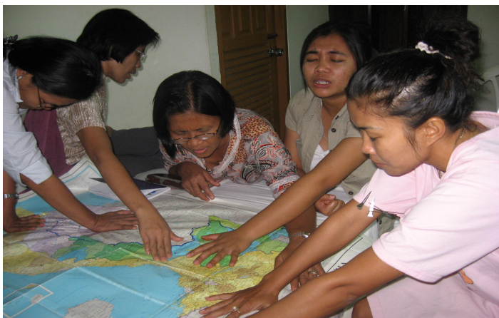
Mission orientation in Thailand before an exposure trip. Each participant laid her hands on the country she wanted to claim.

This was the challenge that inspired the Resources Employment and Community Horizons, (REACH) Inc. in the Philippines to articulate its vision for world missions in 2004. The vision is to be a missionary-sending organization and deploy teams to establish holistic,