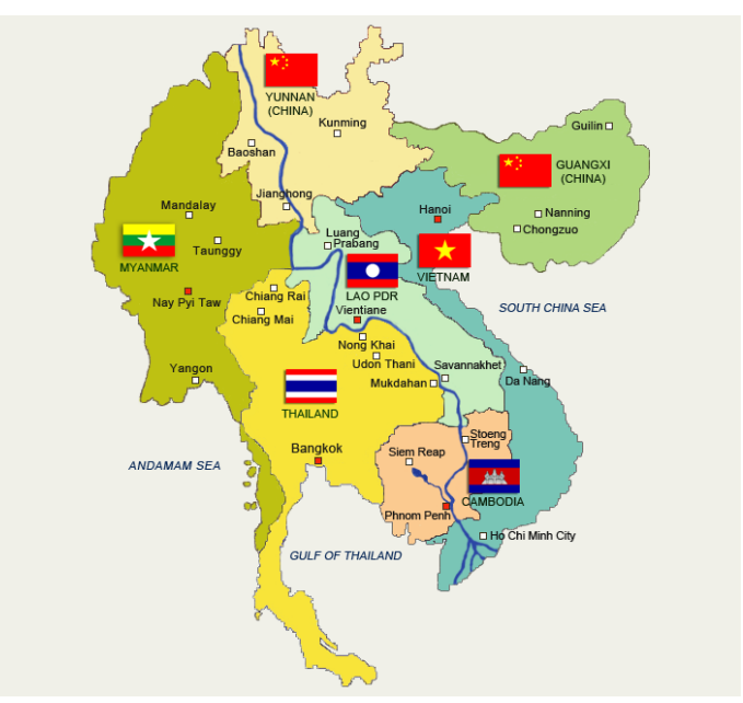
Countries of the Mekong Subregion.

through bars of iron. I will give you hidden treasures, riches stored in secret places, so that you may know that I am the Lord, the God of Israel, who summons you by name."