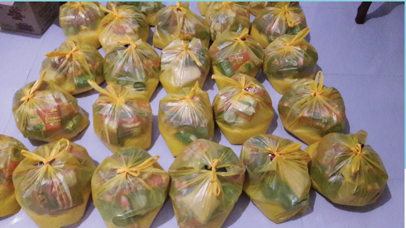
Letty Irizari repacks food for distribution in their neighborhood.