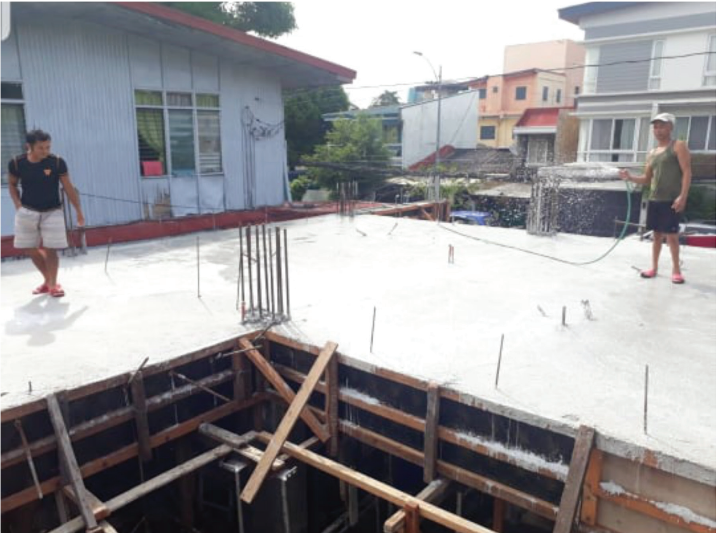
As of June 14, the floor of the mezzanine or upper ground floor was completed. The view is from the front of the property.

With the declaration of an Enhanced Community Quarantine (ECQ) in Metro Manila last March 16, 2020, construction activities were carried out for a few days only until building materials became unavailable. Many of the columns up to the second floor level were erected by then.