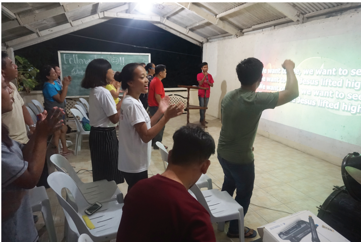
The weekly Wednesday-night fellowship is a mixture of students and professionals who meet at the Solsoloy home.